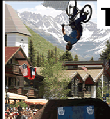
GOING BIG AT THE TEVA MOUNTAIN GAMES

The country's largest celebration of mountain sport, soul & culture returns once again with the Teva Mountain Games in Vail. Professional and amateur athletes compete in 7 sports, along with a photography competition, an interactive exhibition, and live music. Don't miss this exciting event June 5th through the 8th!